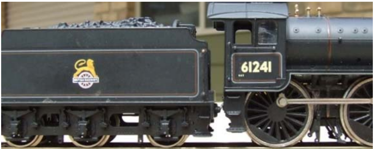
Above: the finished product, an almost invisible drawbar.

Having passed the point of no return by removing the lug, I inserted the last screw and after checking for clearances, placed the now connected loco and tender on some track to admire my handiwork. Shock, horror, the front wheels of the tender were floating a scale 400mm above the track. On closer inspection, I could see that the moulding on the tender was set lower than the mating spot on the loco, causing the drawbar to lift the front of the tender. A quick redesign of the drawbar to include an appropriate step put the wheels back on the track.