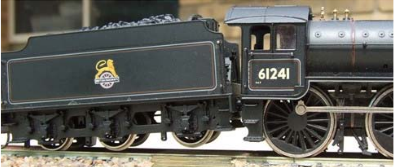
Above: Not quite the desired result Below: View of the underside