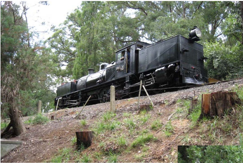
Vivien sent in these photos that she took with her new camera while visiting Puffing Billy