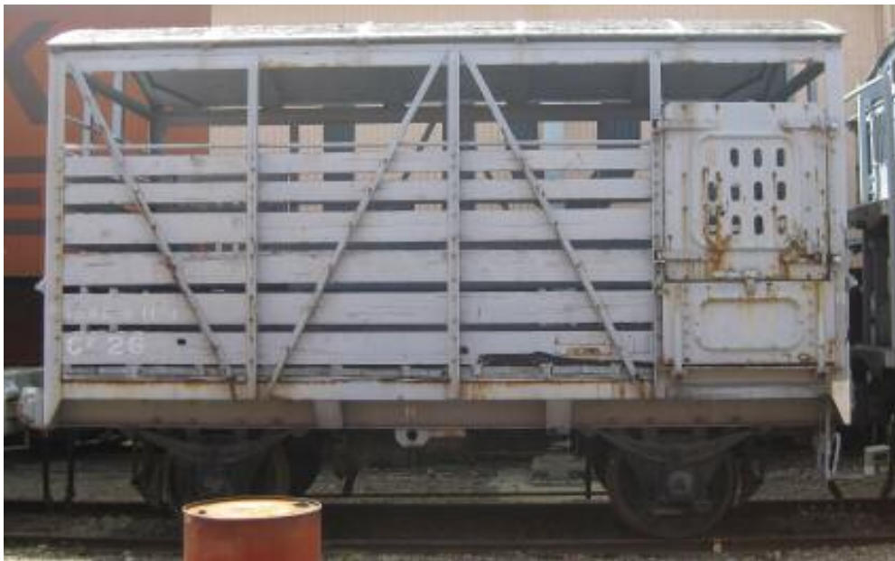
CF26, preserved at the National Railway Museum, Port Dock Station.

While designated “cattle wagons”, they could be loaded with other livestock of similar size, which really means horses, but it is possible that a few found use in circus trains too. As built, the CF wagons were painted in grey, probably the very dark grey (Humbrol M67) with black underframes, then repainted into the blue/grey (Humbrol M27) overall scheme, sometimes black below the underframe, that was applied until mid-1963, then into SAR light grey (Humbrol M64 plus a dash of white) until 1978, some received the ANR dull red paint, and some received AN green and gold from 1982: plenty of variety there! As is so often the case, there are few photographs to be found to confirm the colours, so regard the colour précis above as provisional. At least one example has been preserved; CF26 is at Port Dock, in faded blue-grey paint with black W-irons, springs and journal boxes.