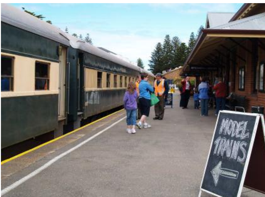
Step from the SteamRanger straight to our display