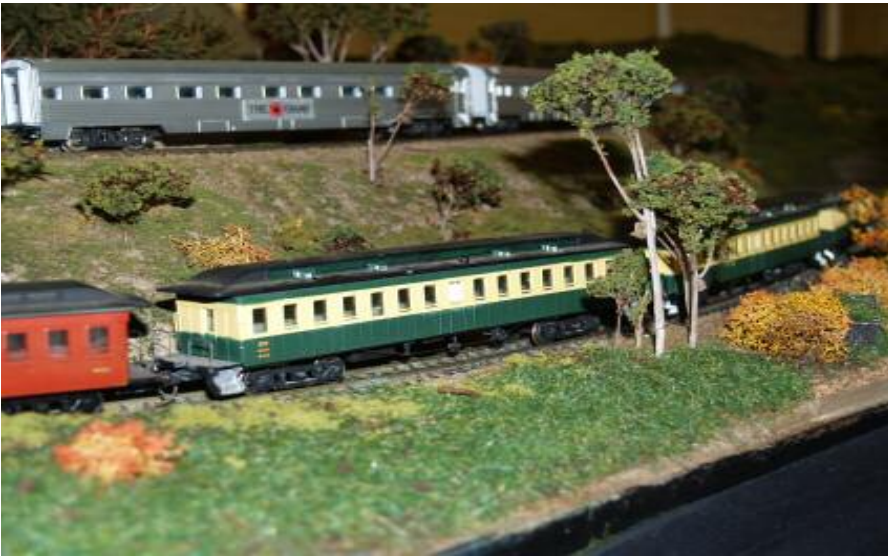
The Ghan gets a birdseye view of a centenary car consist