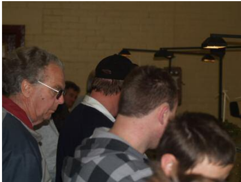
The admiring crowd 3 deep